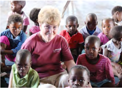
Hudreds of happy kids