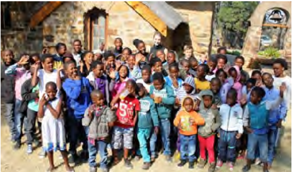
Our Growing Sunday School

"I am the vine; you are the branches. If a man remains in Me and I in him, he will bear much fruit, for apart from Me you can do nothing." John 15:5